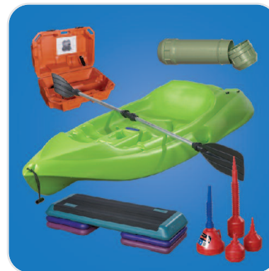
CUSTOM BLOW MOLDING