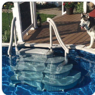
POOL LADDERS AND STEPS

▶ WORLD CLASS BLOW-MOLDED PRODUCTS PROUDLY MADE IN THE USA