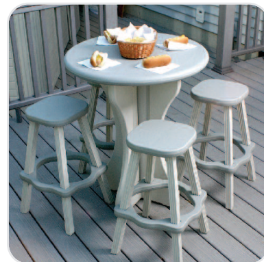
PATIO & SPA ESSENTIALS